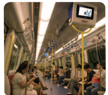
Multimedia / Digital Signage